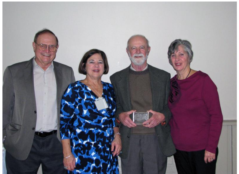
ECFNC Annual Dinner.