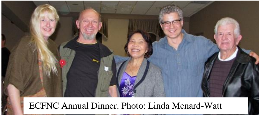
ECFNC Annual Dinner.

Sixty-nine responses were received out of 86 people attending. That means 80.23% survey responses were received. This is an excellent response to a survey!!! Thank you.